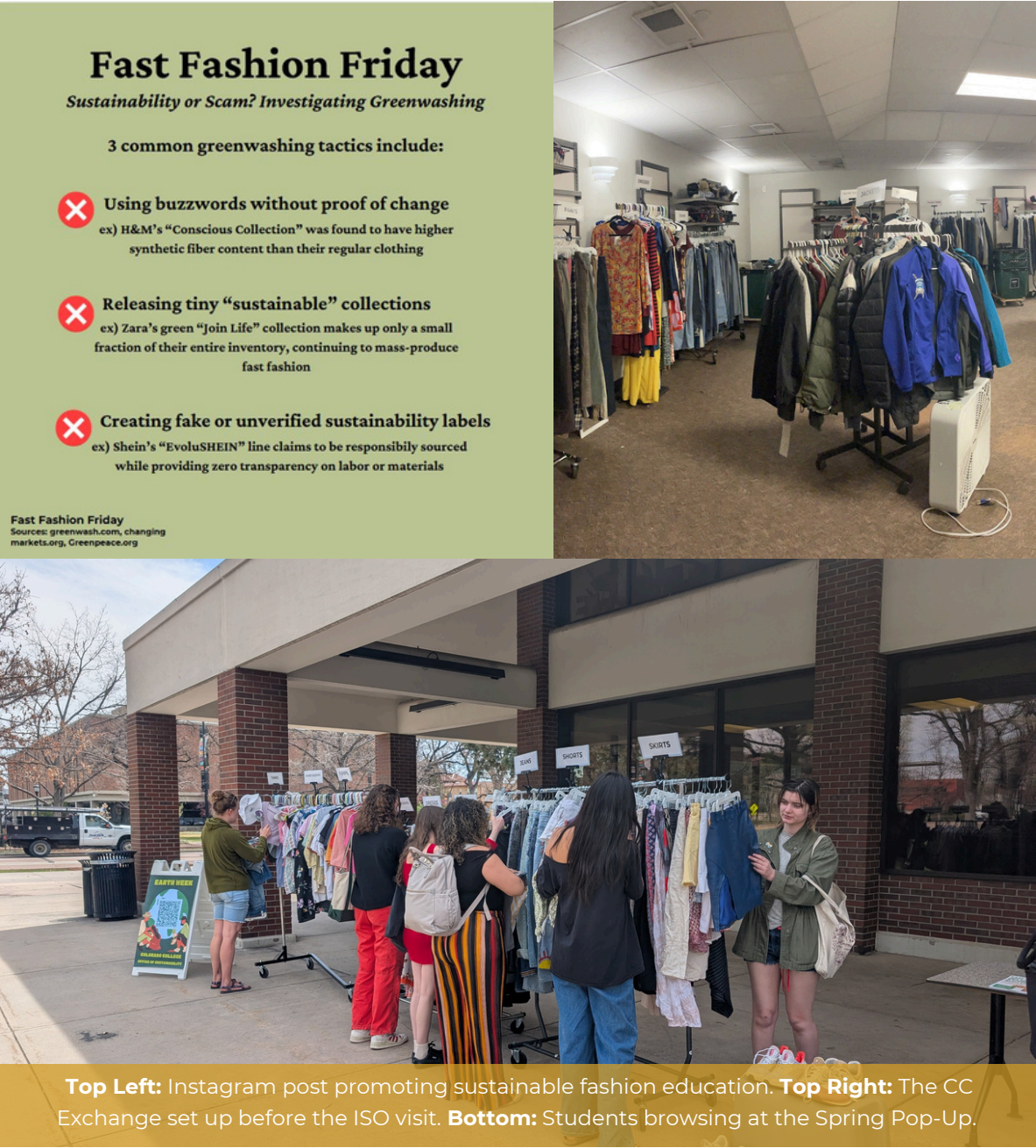
Top Left: Instagram post promoting sustainable fashion education. Top Right: The CC Exchange set up before the ISO visit. Bottom: Students browsing at the Spring Pop-Up.