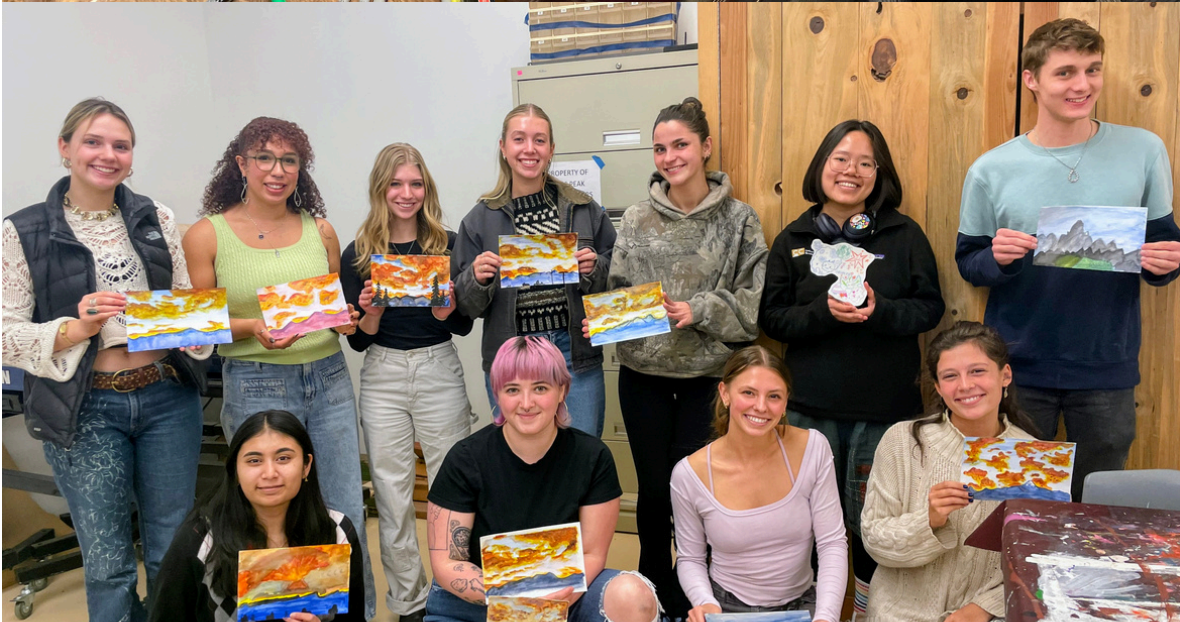
Top Left: Picture of the Admin. Asst. Team. Top Right: Student team at the Winter Dinner Celebration. Bottom: Student team during Spring Revival posing with their artwork.