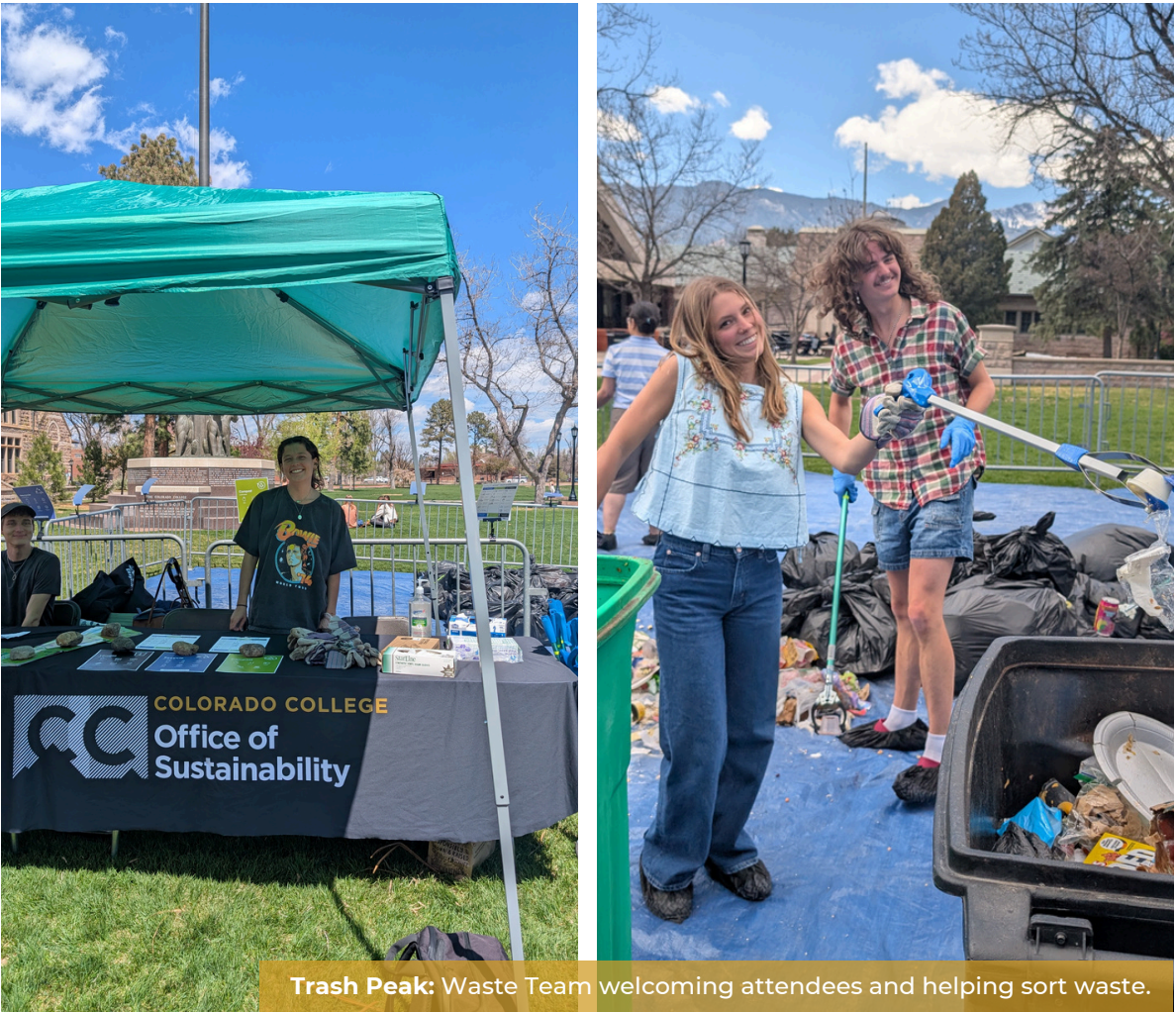
Trash Peak: Waste Team welcoming attendees and helping sort waste.