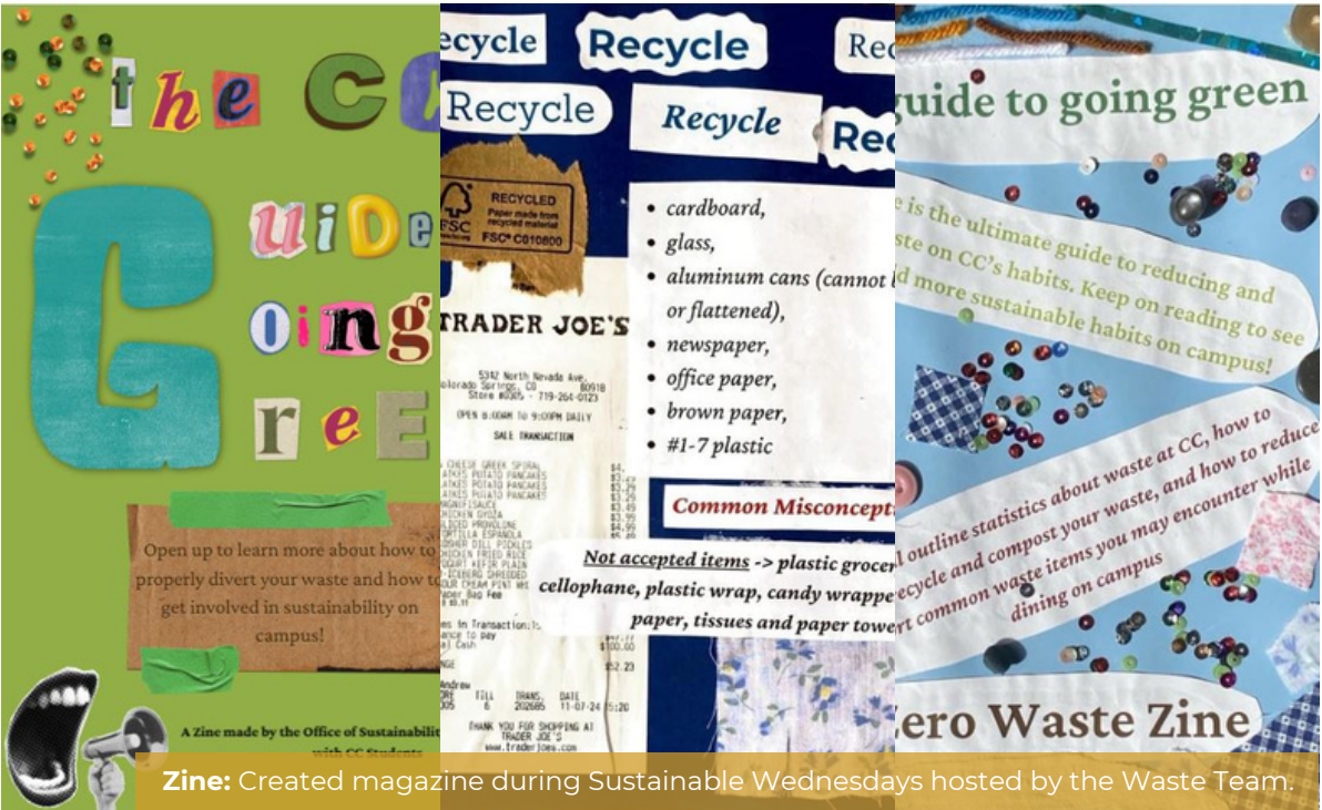
Zine: Created magazine during Sustainable Wednesdays hosted by the Waste Team.