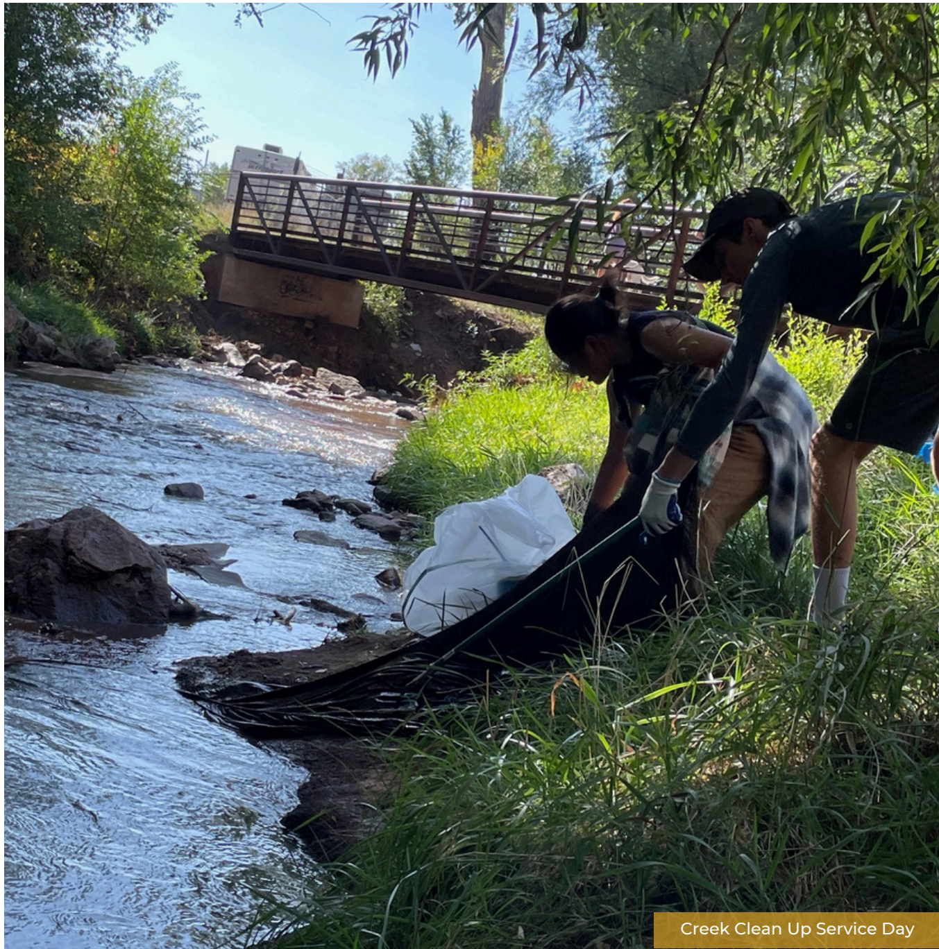
Creek Clean Up Service Day