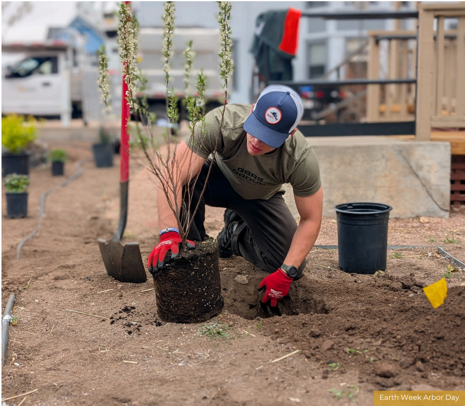
Earth Week Arbor Day