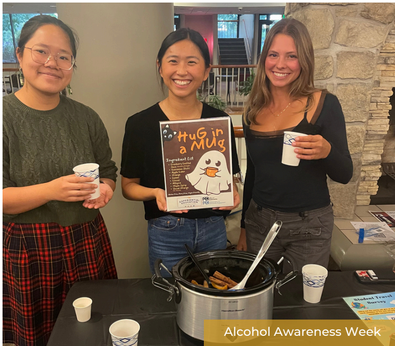
Alcohol Awareness Week