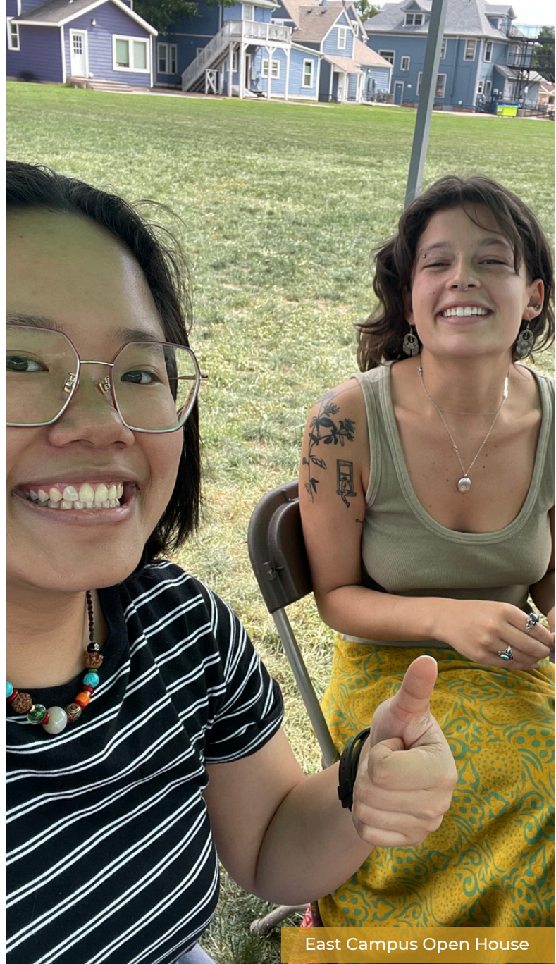
East Campus Open House